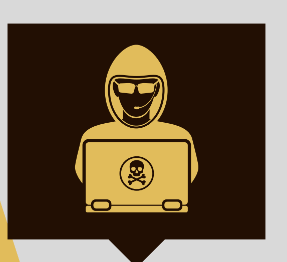
Analyzing the attacker's TTPs