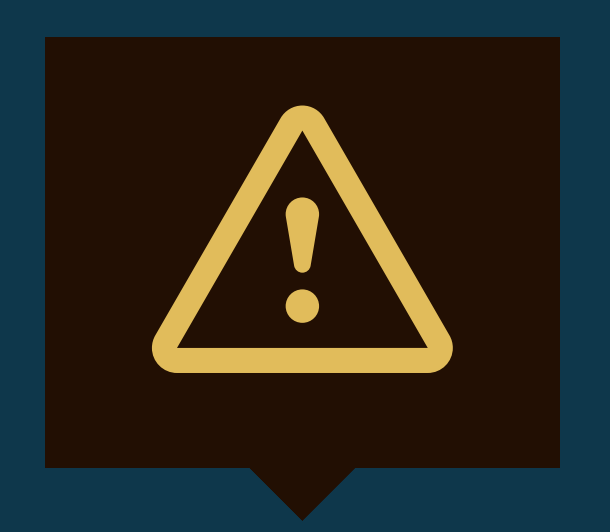
Constant monitoring and early warning