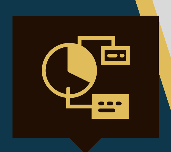
Mapping the different elements of HICs