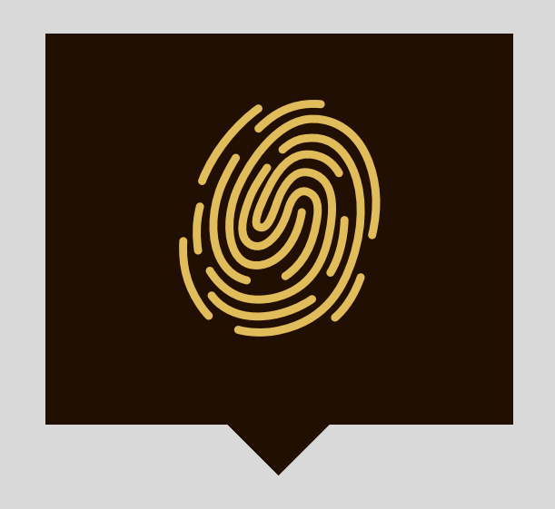
Actionable intelligence for takedowns